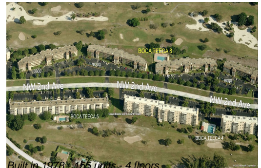
Built in 1978 - 155 units - 4 floors