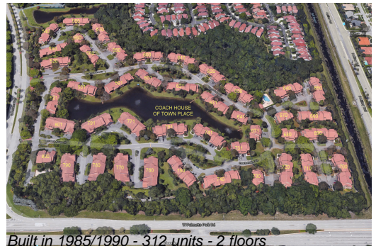
Built in 1985/1990 - 312 units - 2 floors