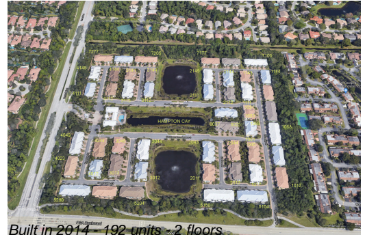
Built in 2014 - 192 units - 2 floors