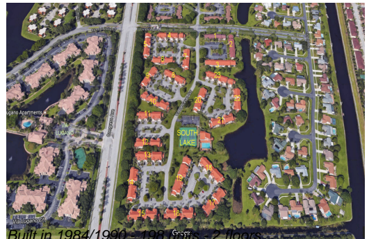
Built in 1984/1990 - 190 Units - 2 Floors