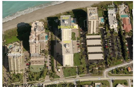
Built in 1977 - 94 units - 12 floors