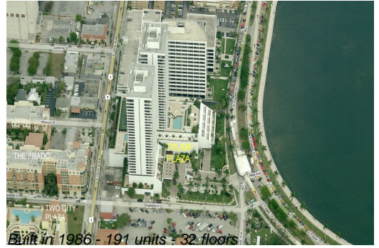
Built in 1986 - 191 units - 32 floors

The above valuated price is a baseline figure that does not take into account any specific renovation, upgrade, split, merge, or deterioration of the unit.