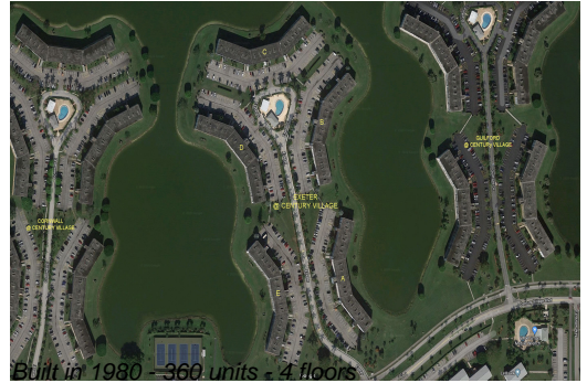
Built in 1980 - 360 units - 4 floors