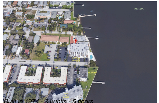
Built in 1974 - 34 units - 5 floors