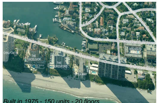
Built in 1975 - 150 units - 20 floors