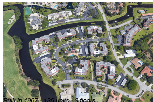
Built in 1967 - 136 units - 3 floors