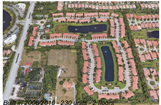
Built in 2006/2010 - 230 units - 2 floors