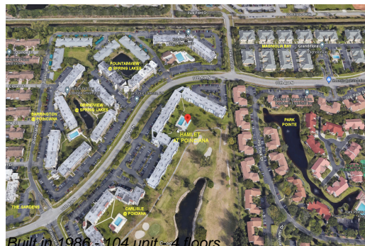
Built in 1986 - 104 unit - 4 floors