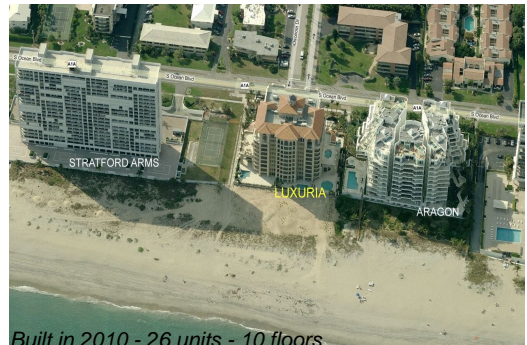
Built in 2010 - 26 units - 10 floors