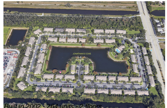
Built in 2002 - 264 units - 2 floors