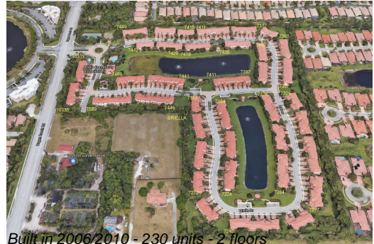
Built in 2006/2010 - 230 units - 2 floors