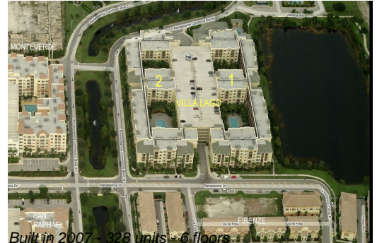
Built in 2007 - 328 units - 6 floors