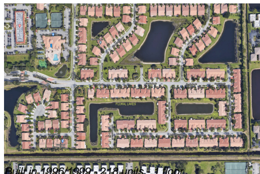
Built in 1996-1999, 218 units, 1 floor