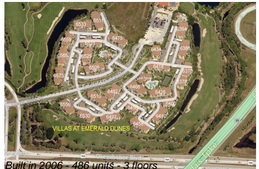
Built in 2006 - 486 units - 3 floors