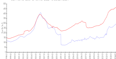
San Remo Golf & Tennis Club vs Boca Raton