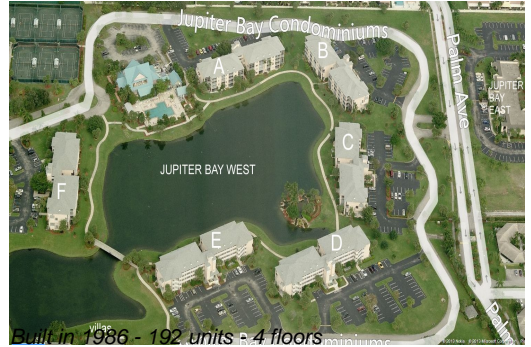
Built in 1986 - 192 units - 4 floors