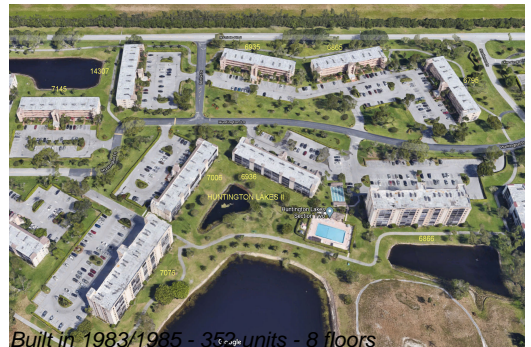
Built in 1983/1985 - 352 units - 8 floors