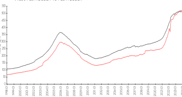
West Palm Beach vs Palm Beach

West Palm Beach: $511/sq. ft. Palm Beach: $475/sq. ft.