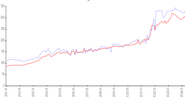
St Andrews at Polo Club vs Wellington