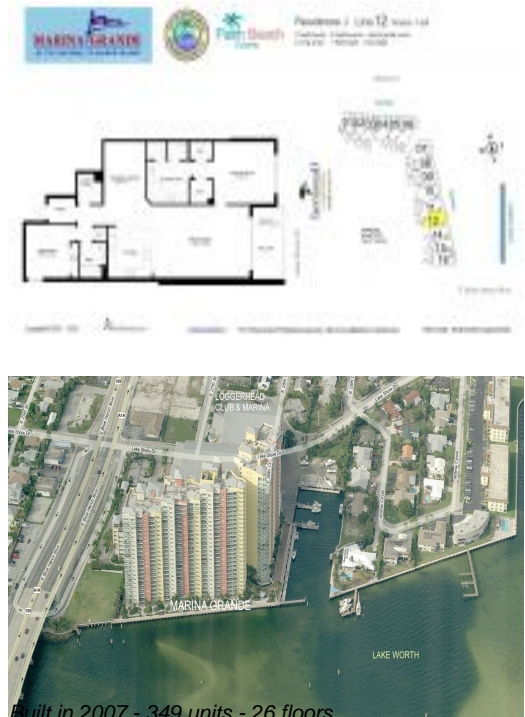
Built in 2007 - 349 units - 26 floors