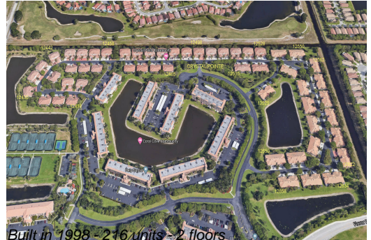
Built in 1998 - 216 units - 2 floors