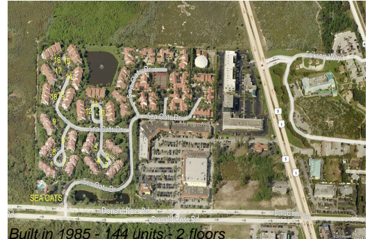
Built in 1985 - 144 units - 2 floors

The above valuated price is a baseline figure that does not take into account any specific renovation, upgrade, split, merge, or deterioration of the unit.