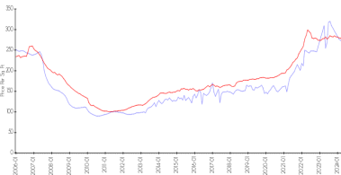
San Raphael vs Boynton Beach