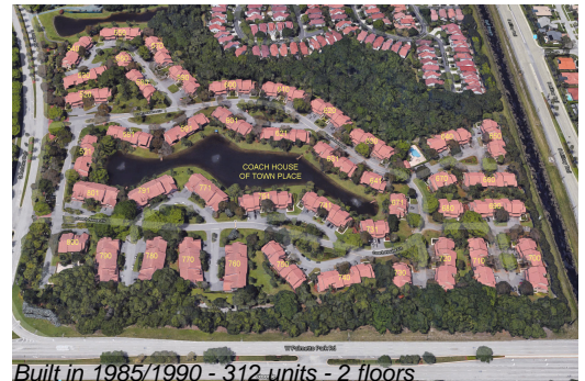
Built in 1985/1990 - 312 units - 2 floors