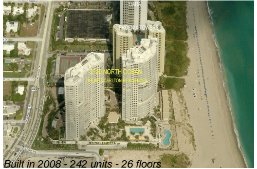
Built in 2008 - 242 units - 26 floors