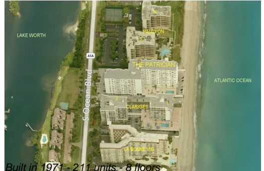
Built in 1971 - 211 units - 8 floors