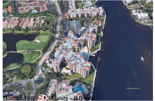
Built in 1989 - 137 units - 8 floors

The above valuated price is a baseline figure that does not take into account any specific renovation, upgrade, split, merge, or deterioration of the unit.