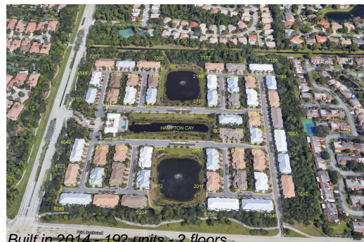
Built in 2014 - 192 units - 2 floors