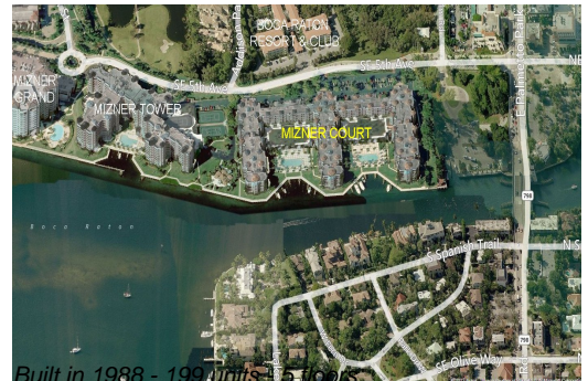
Built in 1988 - 199 Units - 151,000 sq. ft.