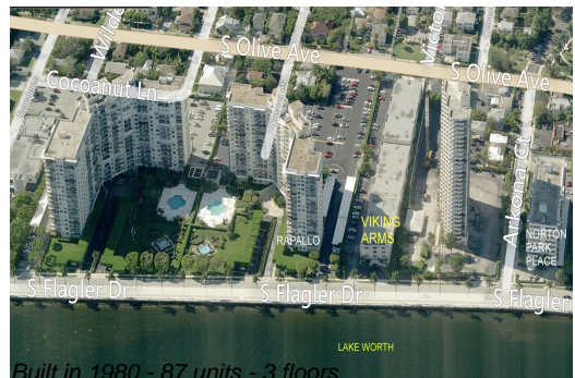
Built in 1980 - 87 units - 3 floors