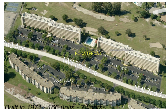
Built in 1971 - 166 units - 7 floors