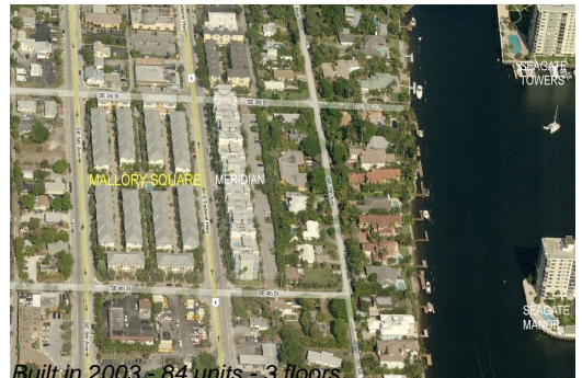
Built in 2003 - 84 units - 3 floors