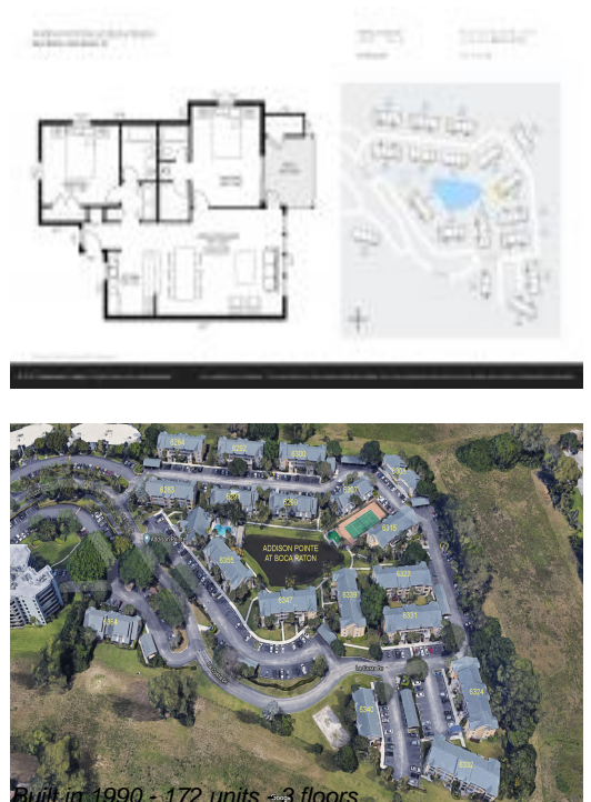
Built in 1990 - 172 units - 2 floors