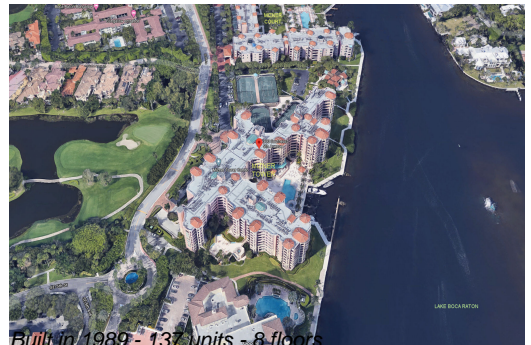
Built in 1989 - 137 units - 8 floors