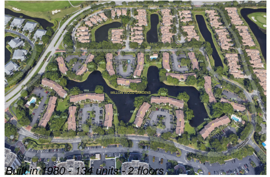
Build in 1980 - 134 units - 2 floors

The above valuated price is a baseline figure that does not take into account any specific renovation, upgrade, split, merge, or deterioration of the unit.