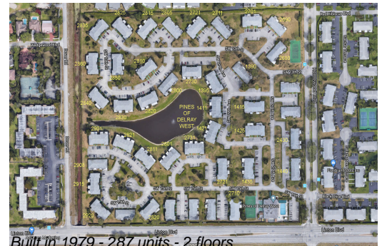
Built in 1979 - 287 units - 2 floors