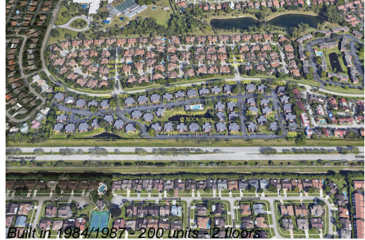
Built in 1984/1987 - 200 Units - 2 floors