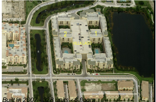
Built in 2007 - 328 units - 6 floors