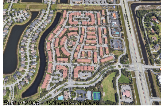
Built in 2006 - 193 units - 3 floors