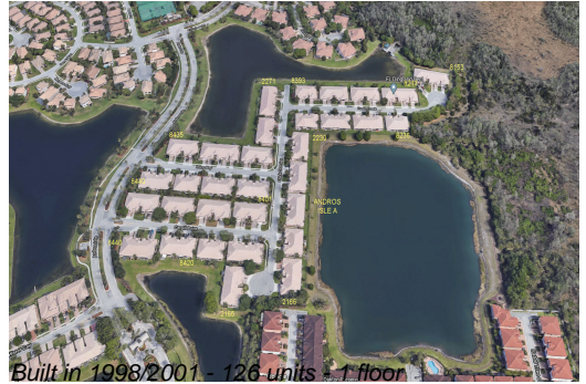
Built in 1998/2001 - 126 units - 1 floor