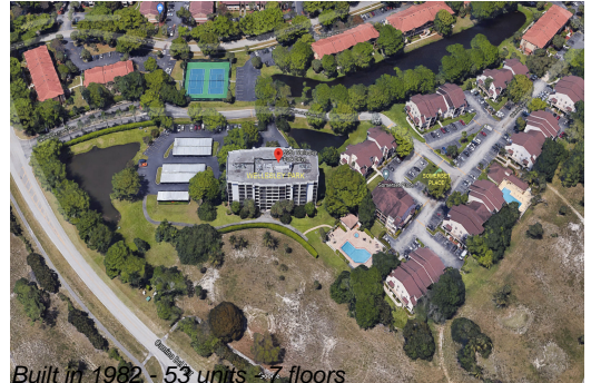
Built in 1982 - 53 units - 7 floors