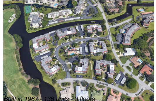
Built in 1967 - 136 units - 3 floors