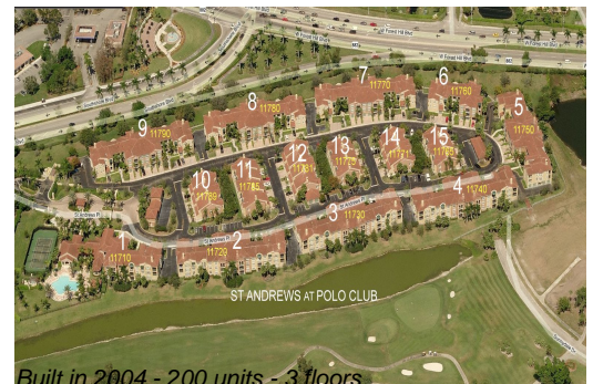
Built in 2004 - 200 units - 3 floors