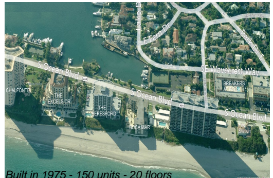
Built in 1975 - 150 units - 20 floors