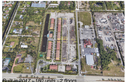
Built in 2017 - 180 units - 2 floors