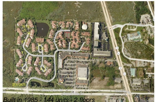
Built in 1985 - 144 units - 2 floors